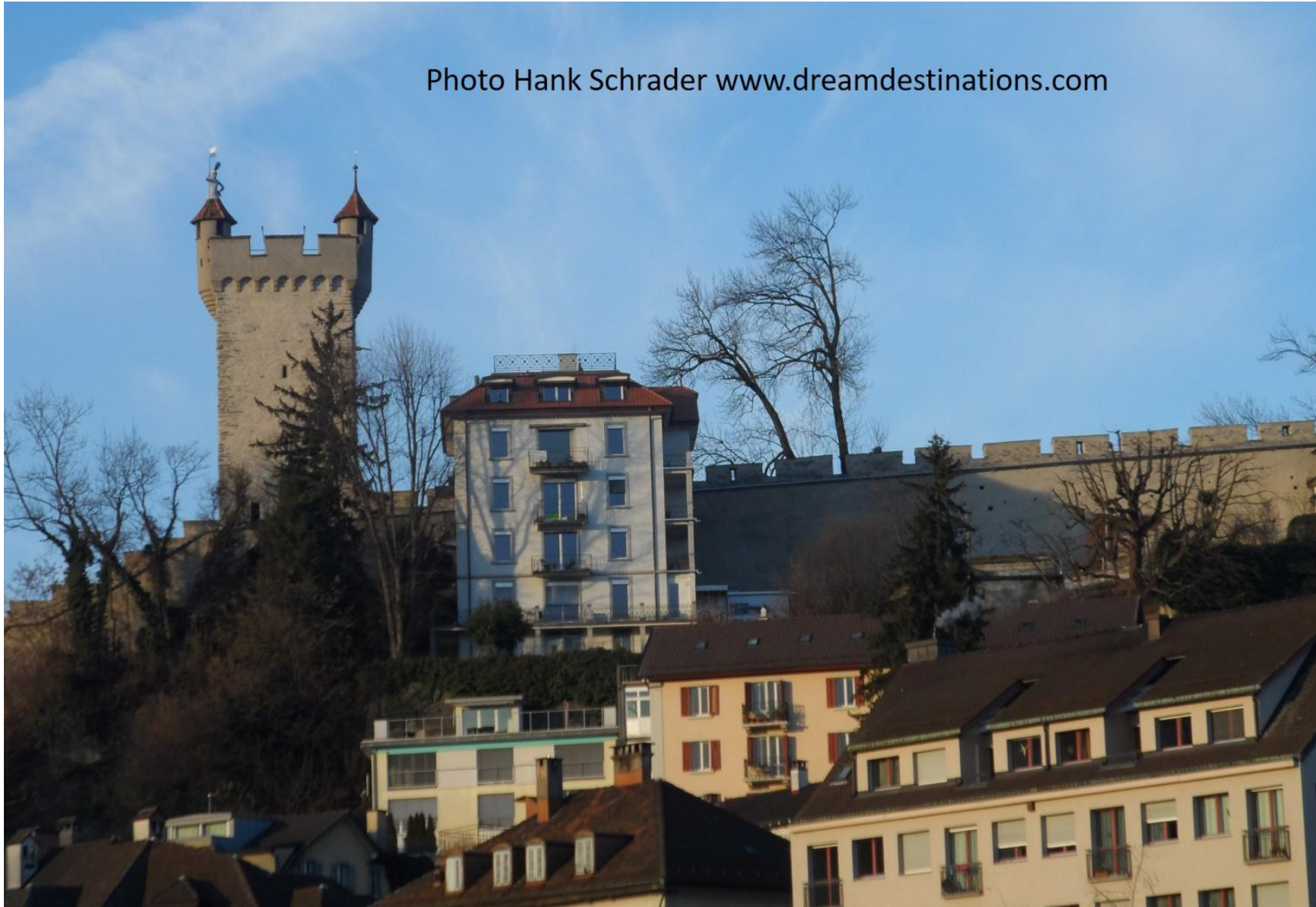
www.dreamdestinations.com