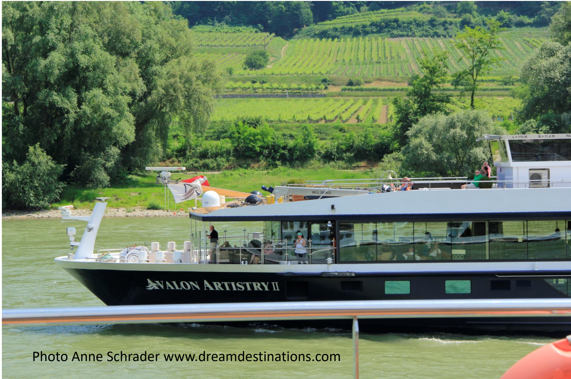
www.dreamdestinations.com