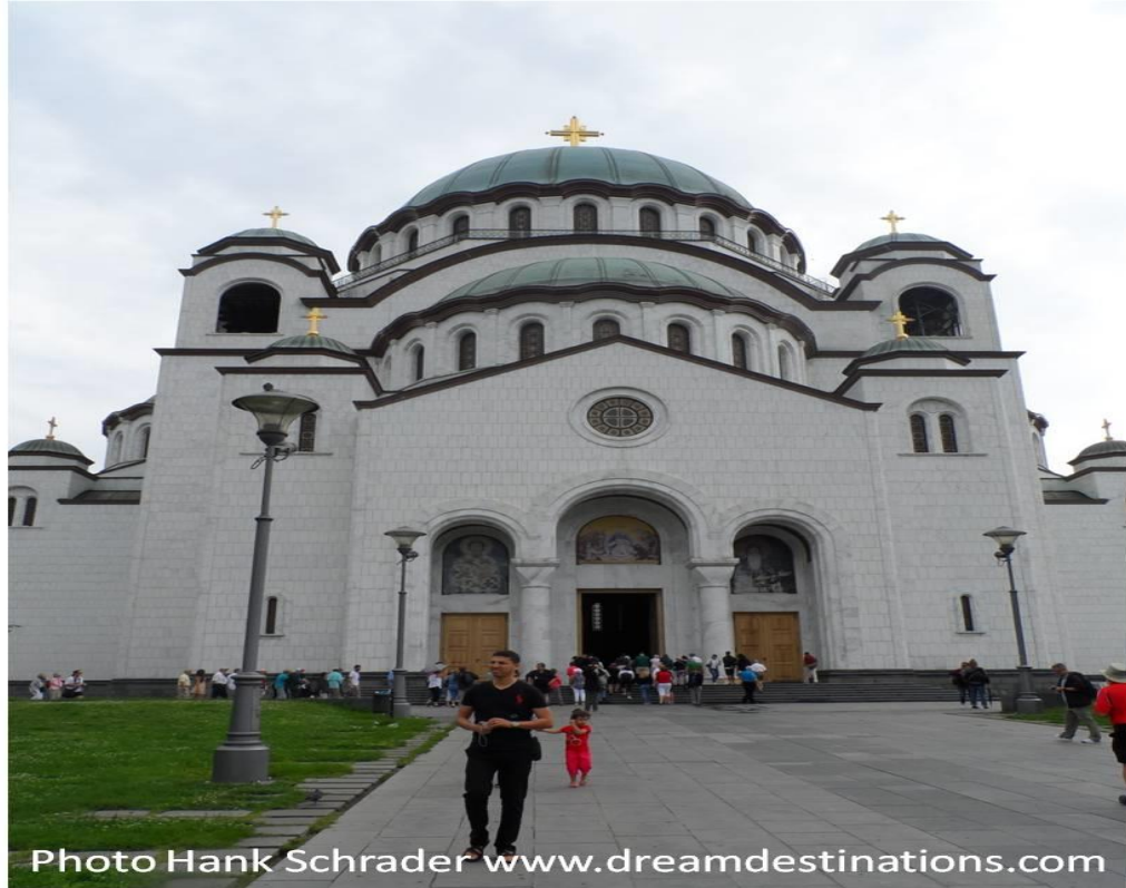
St Sava Cathedral