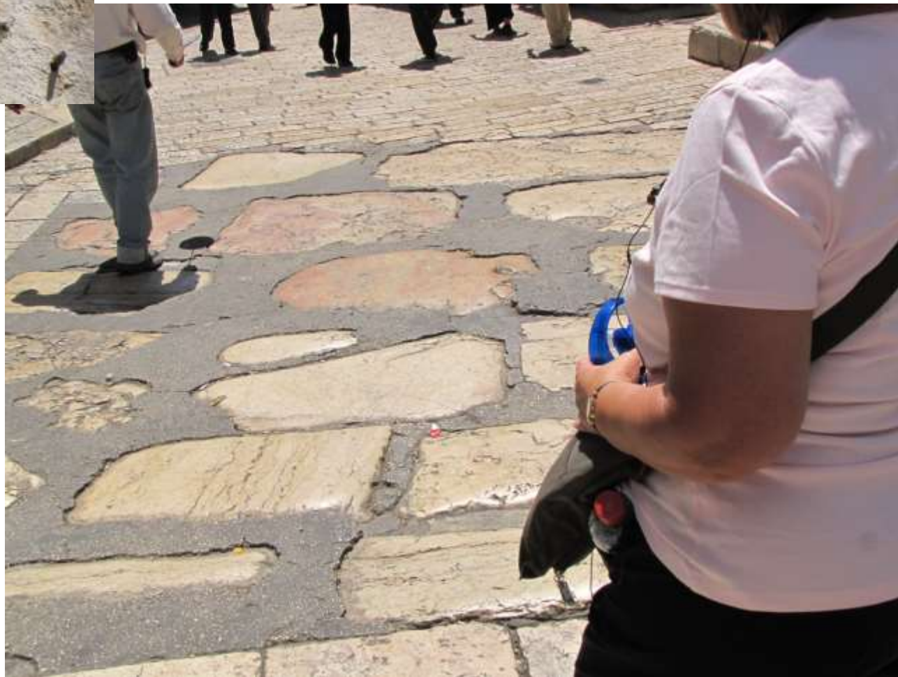
VIA DOLOROSA Way of Sorrows