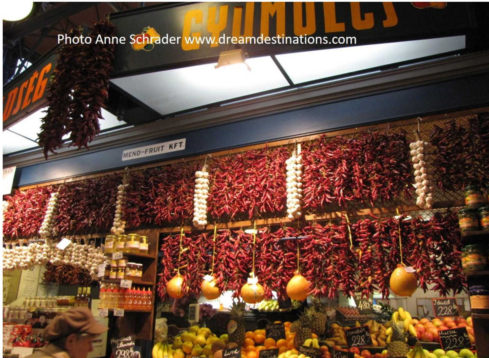
www.dreamdestinations.com