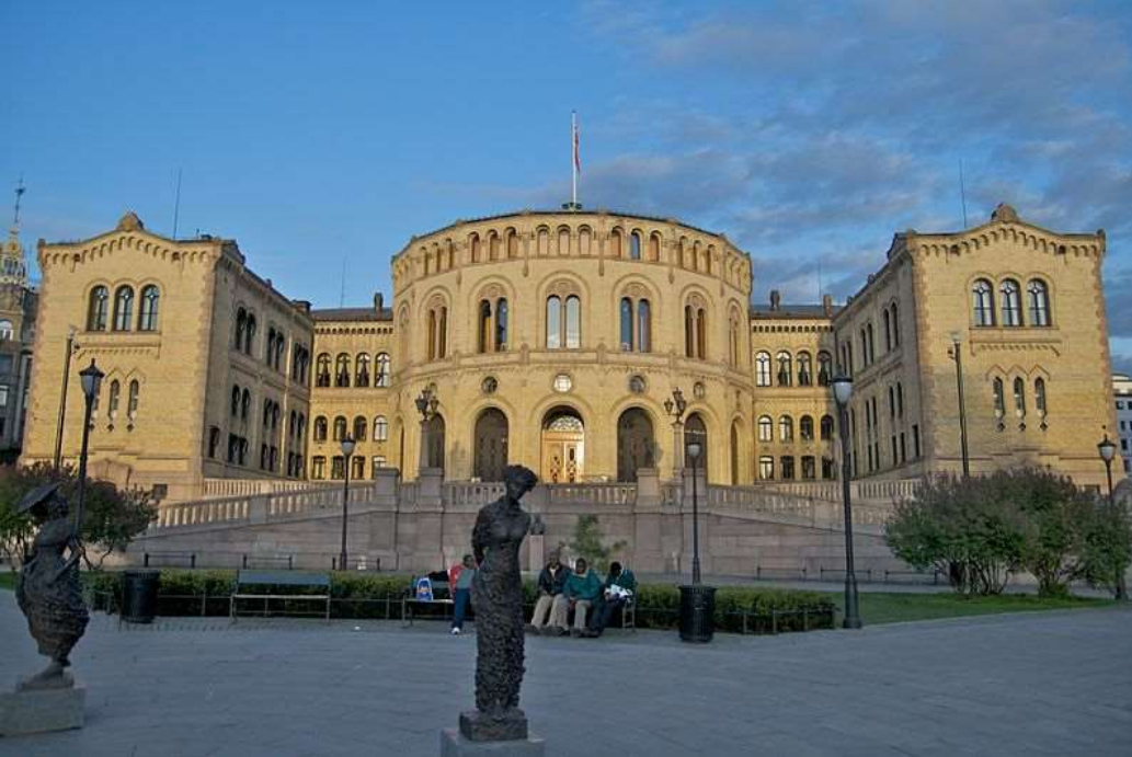
Norway's Parliament