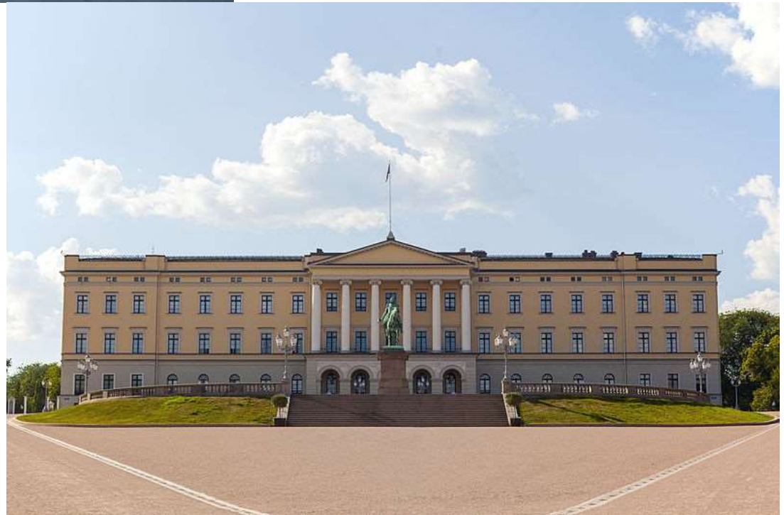
Oslo Royal Palace