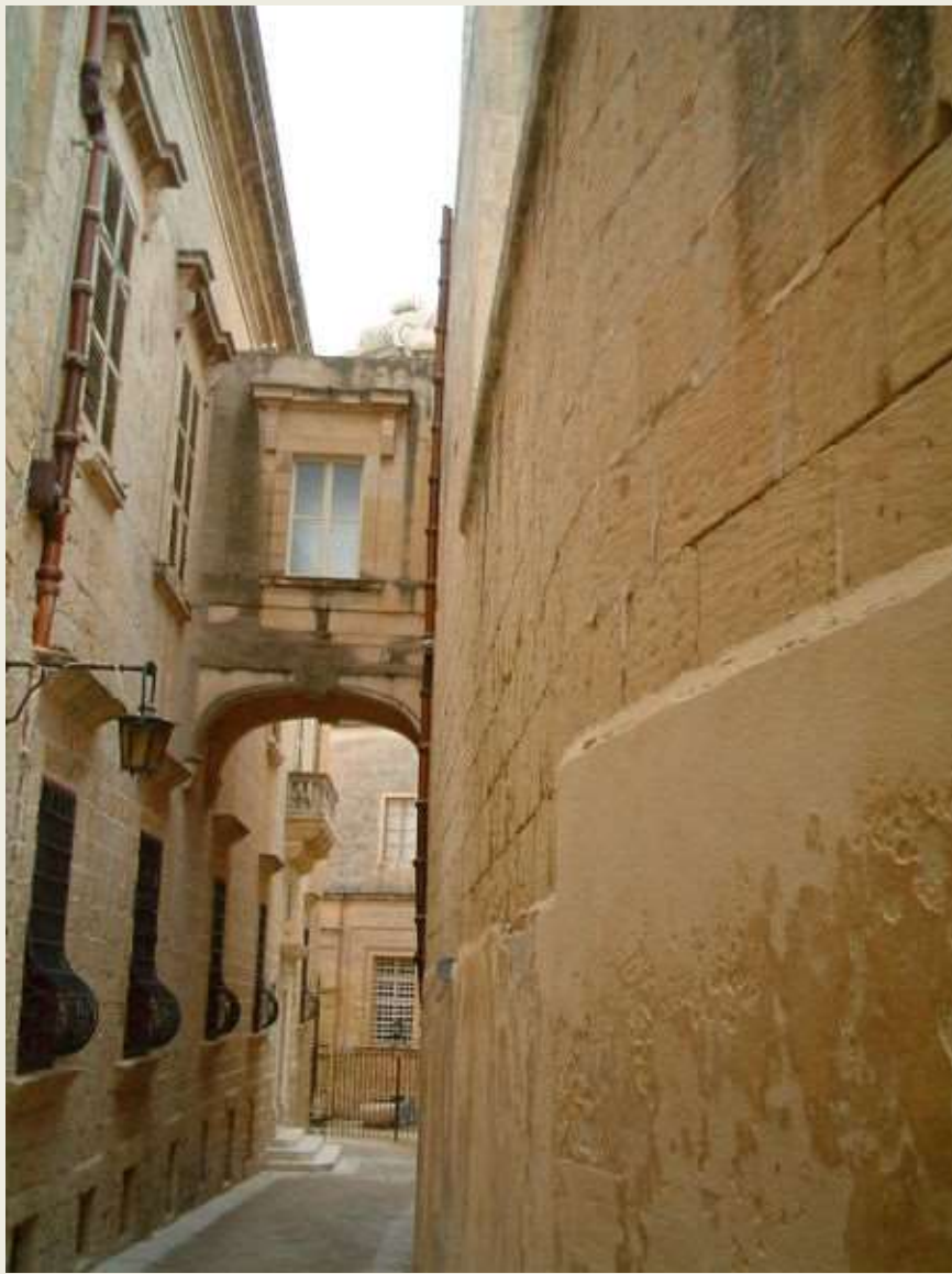
Typical narrow streets Mdina