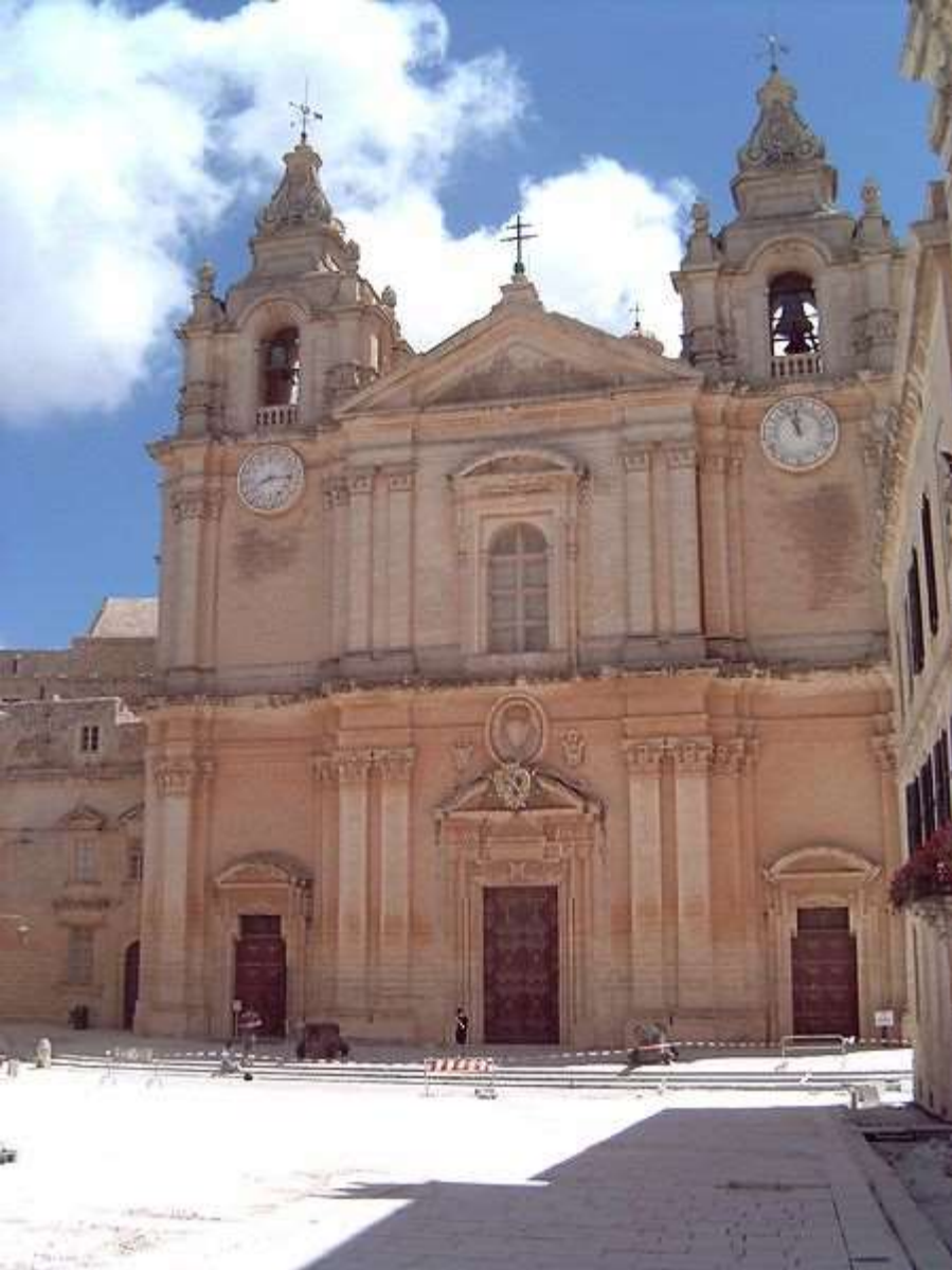
Cathedral of St. Paul