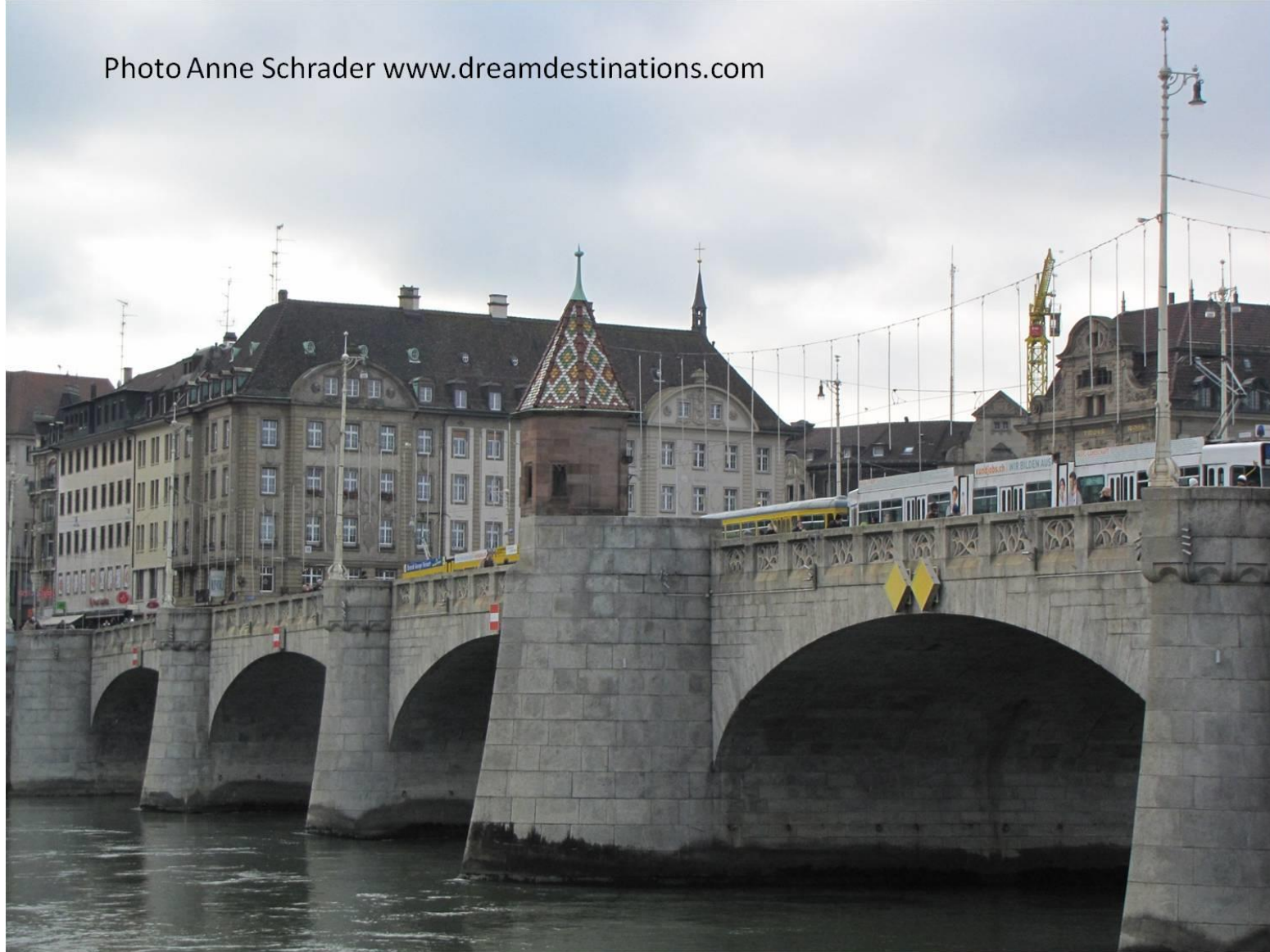
www.dreamdestinations.com