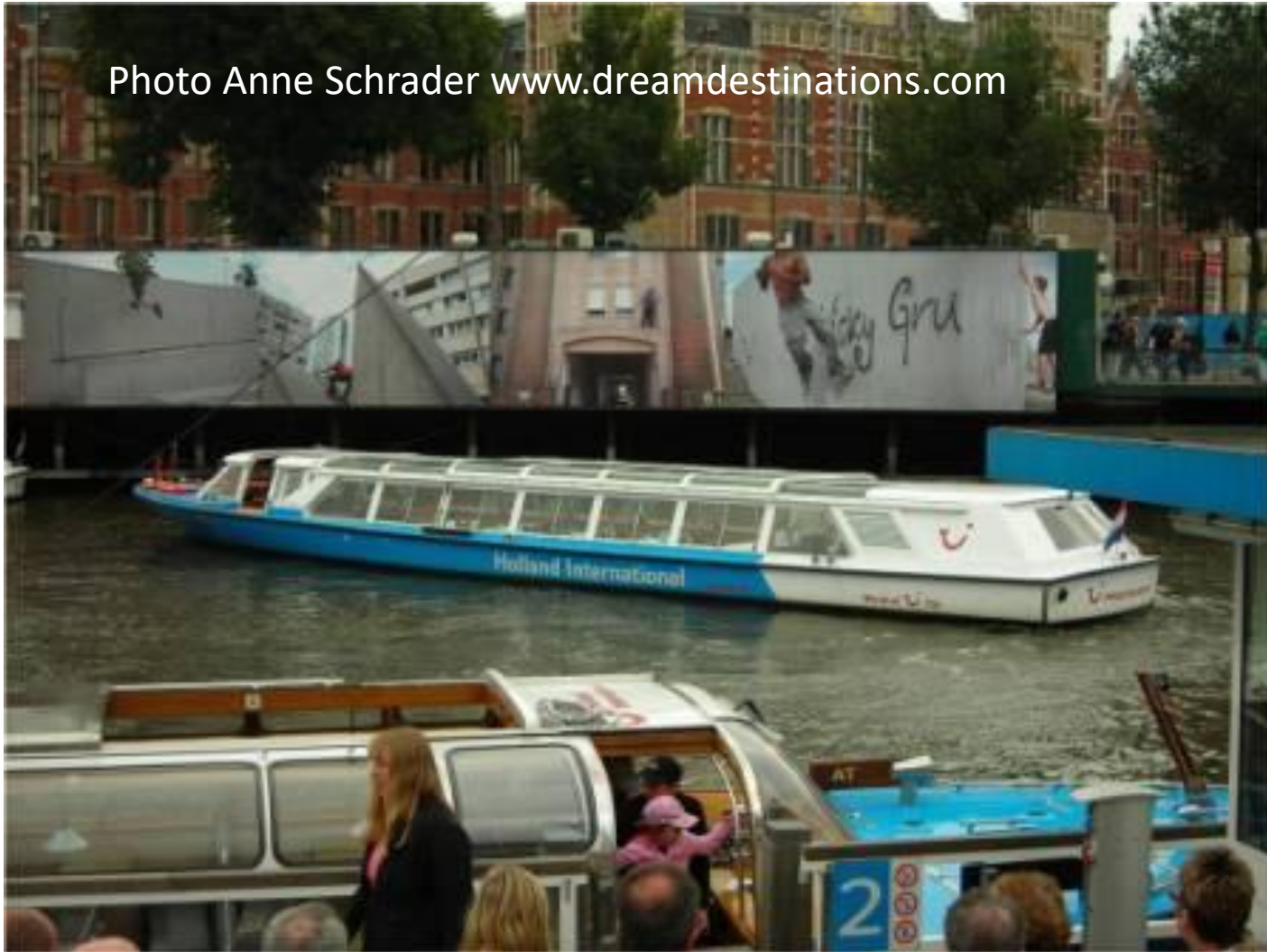
www.dreamdestinations.com