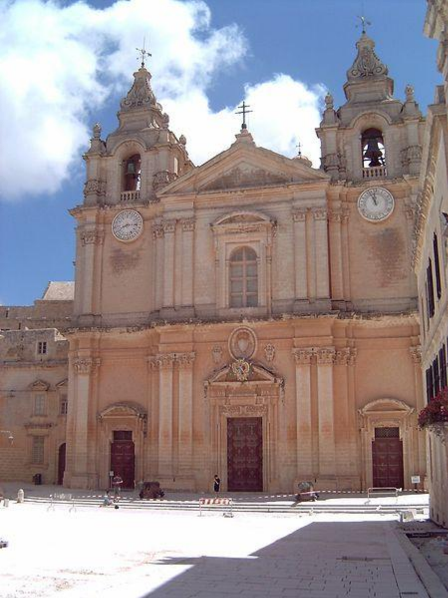
Cathedral of St. Paul