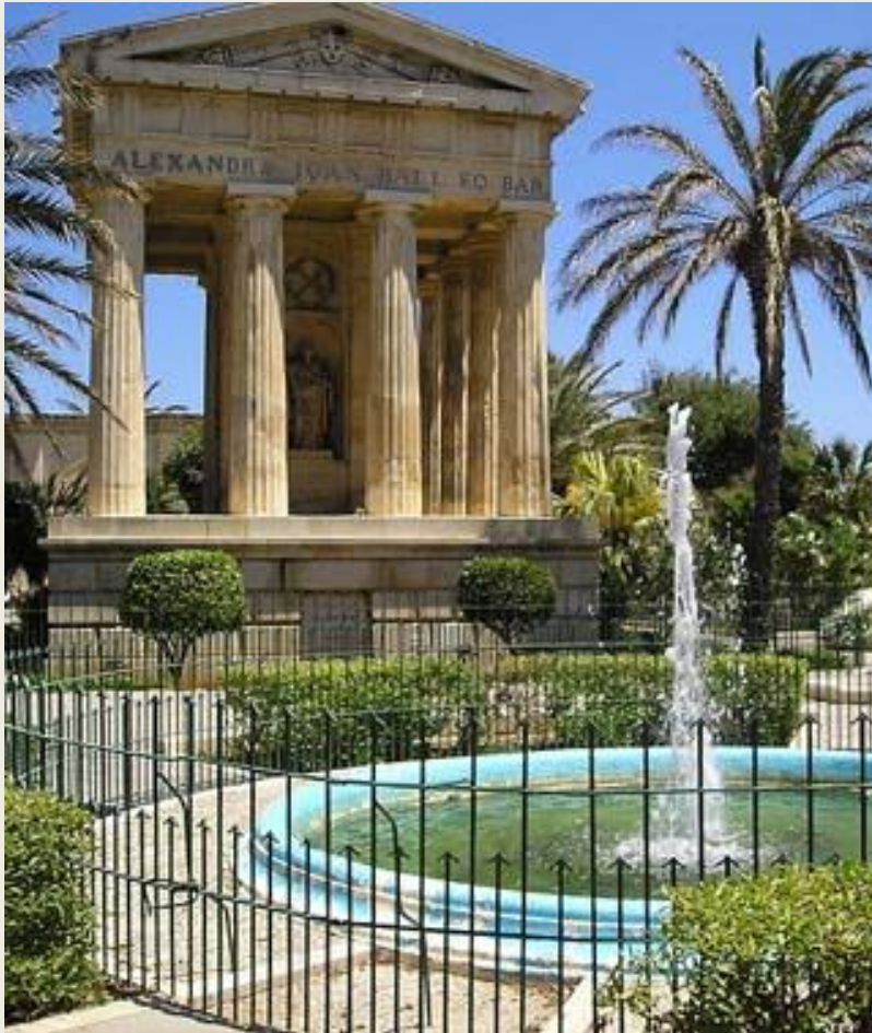
Lower Barrakka Gardens, Valletta, Malta