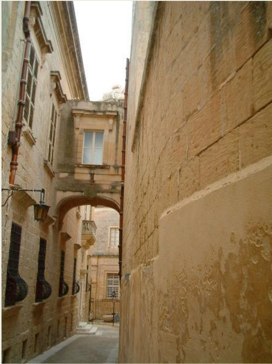
Typical narrow streets Mdina