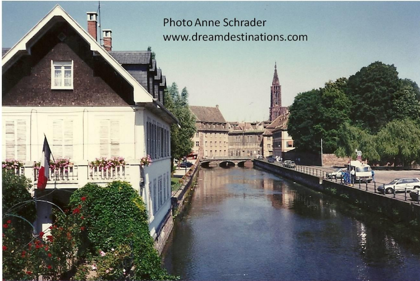
www.dreamdestinations.com