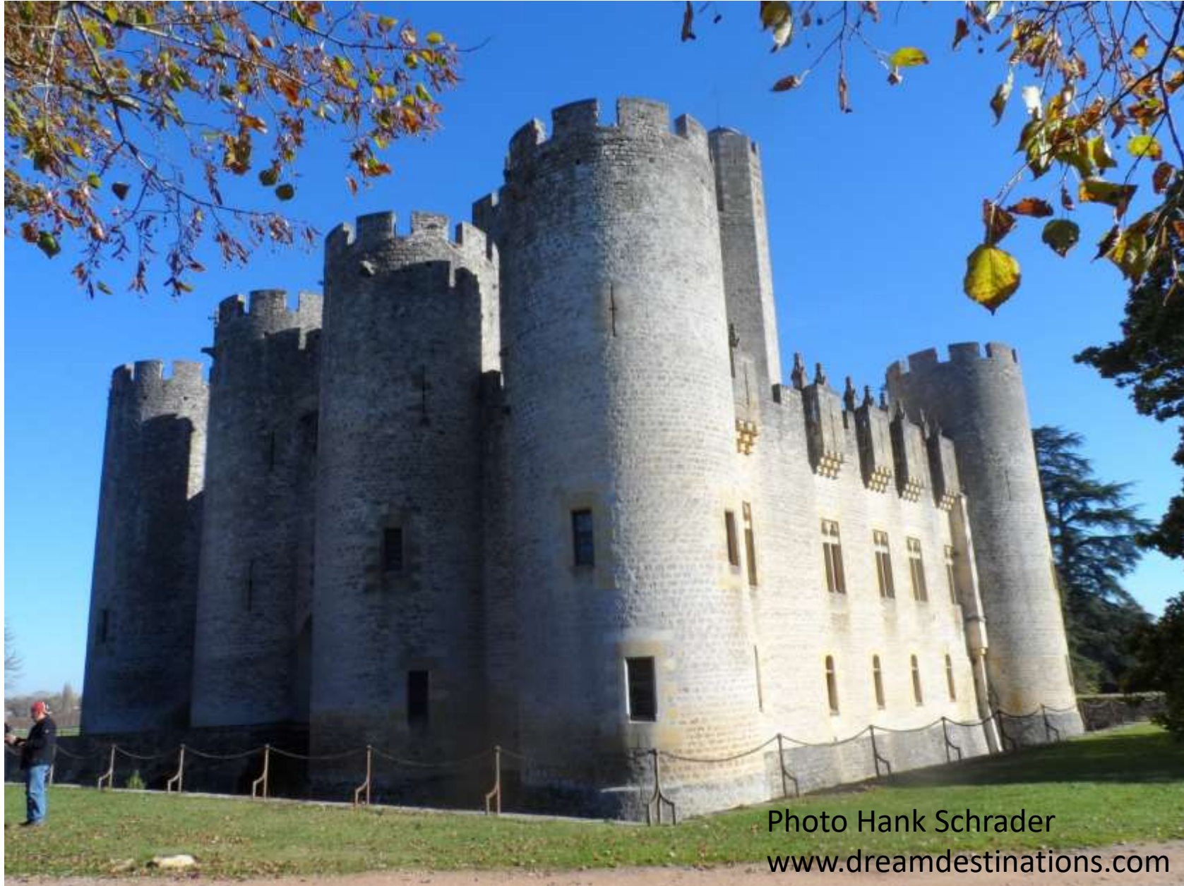
www.dreamdestinations.com