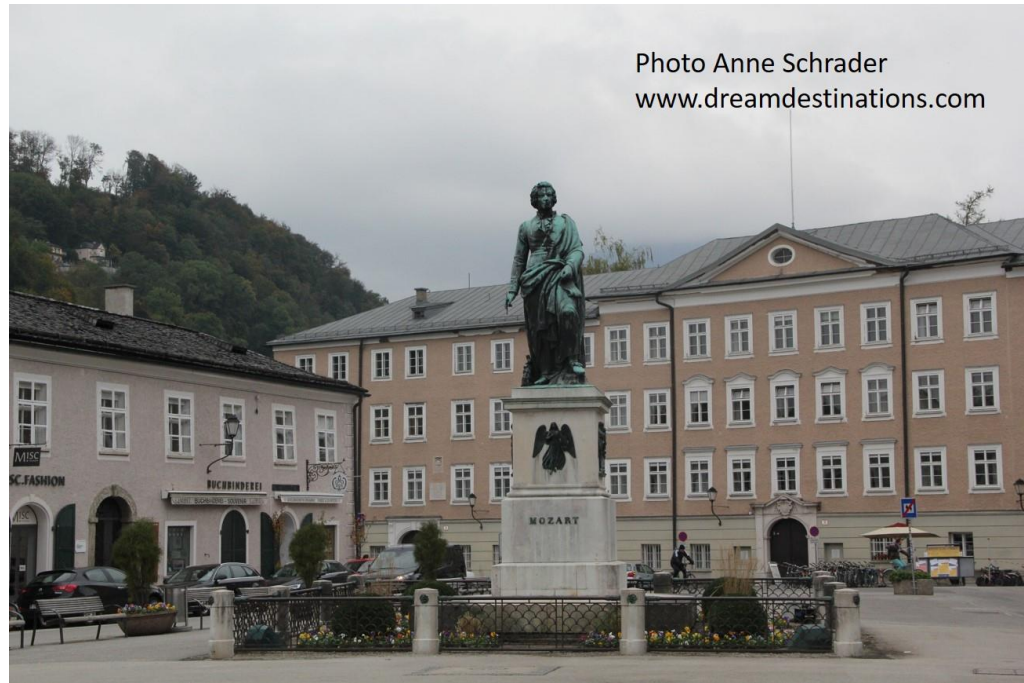
www.dreamdestinations.com