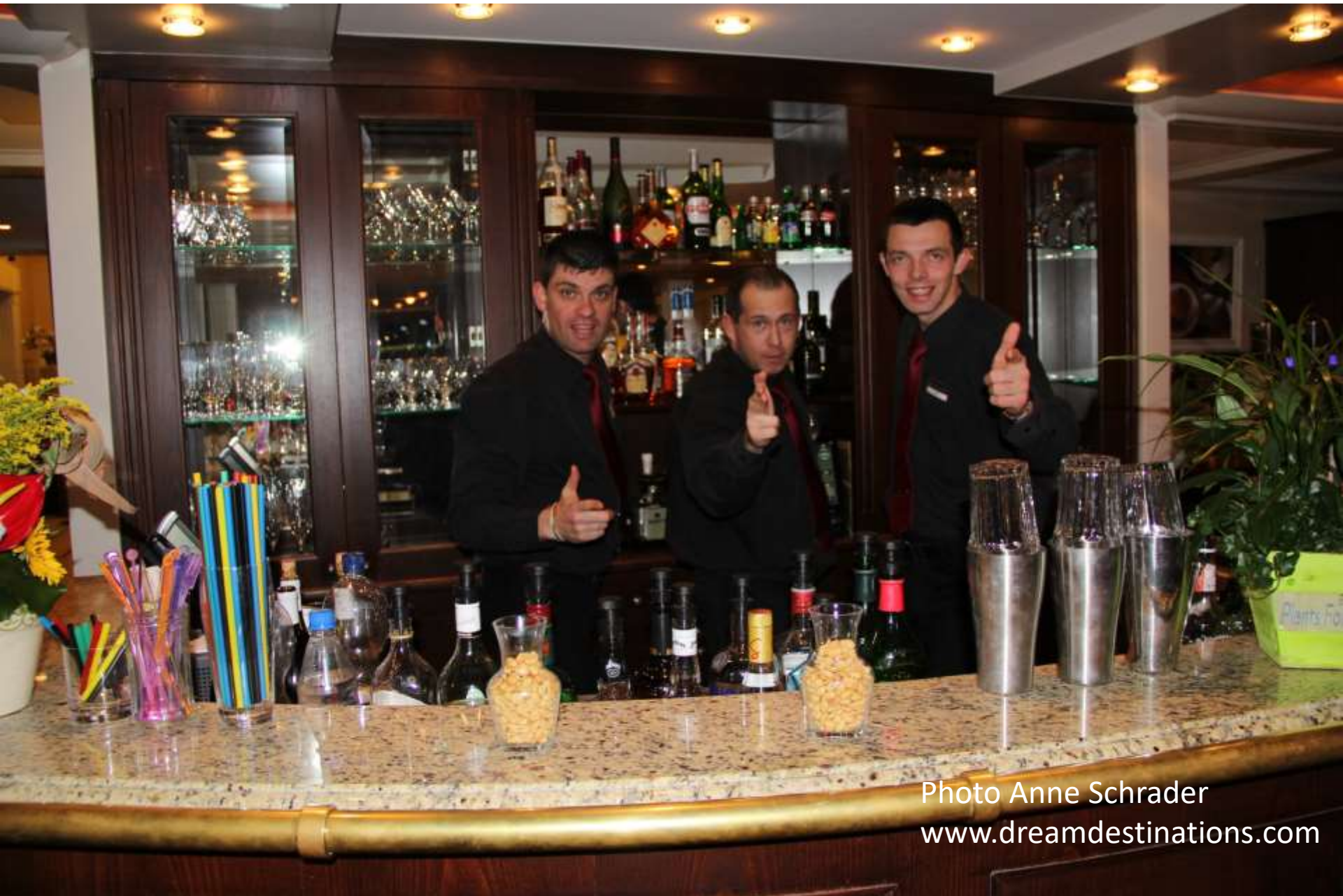
www.dreamdestinations.com