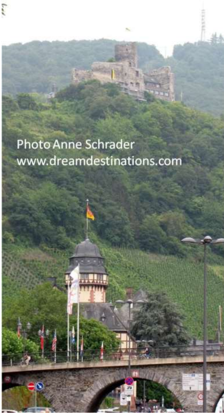
www.dreamdestinations.com