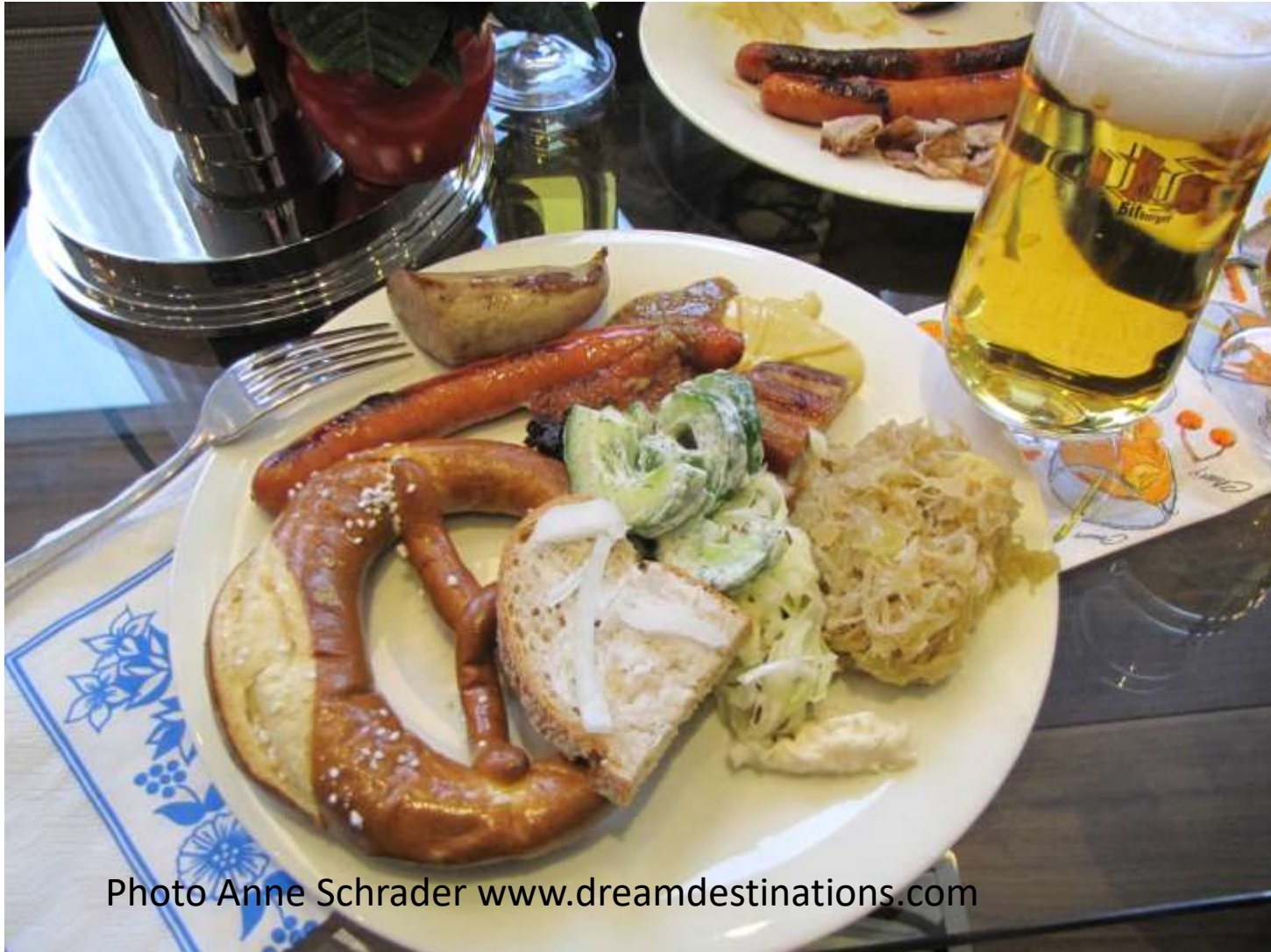
www.dreamdestinations.com