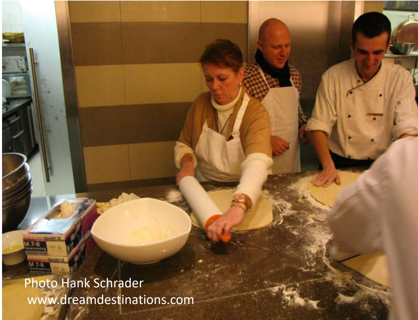
www.dreamdestinations.com