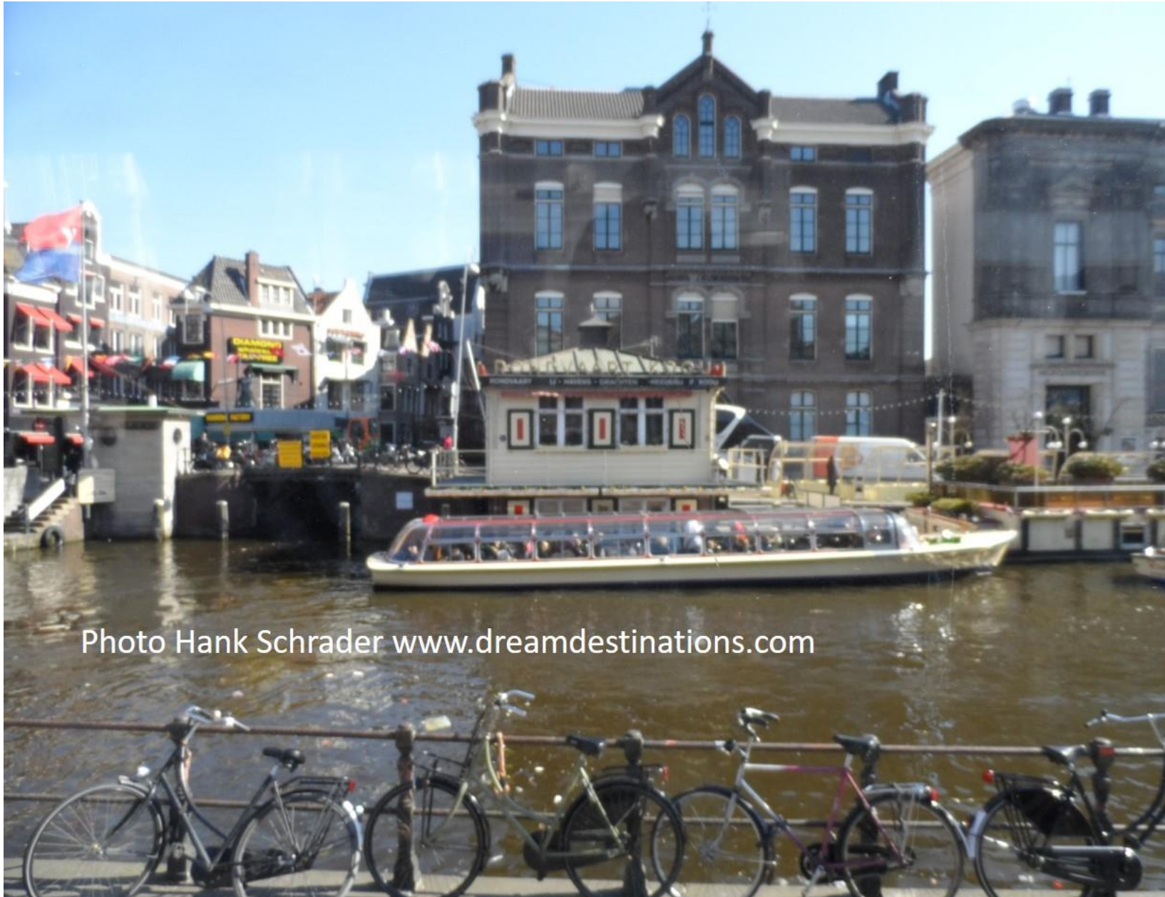
www.dreamdestinations.com