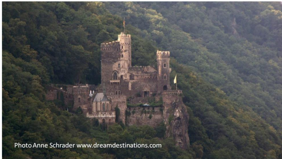
Rheinstein Castle, Rhine River Castles