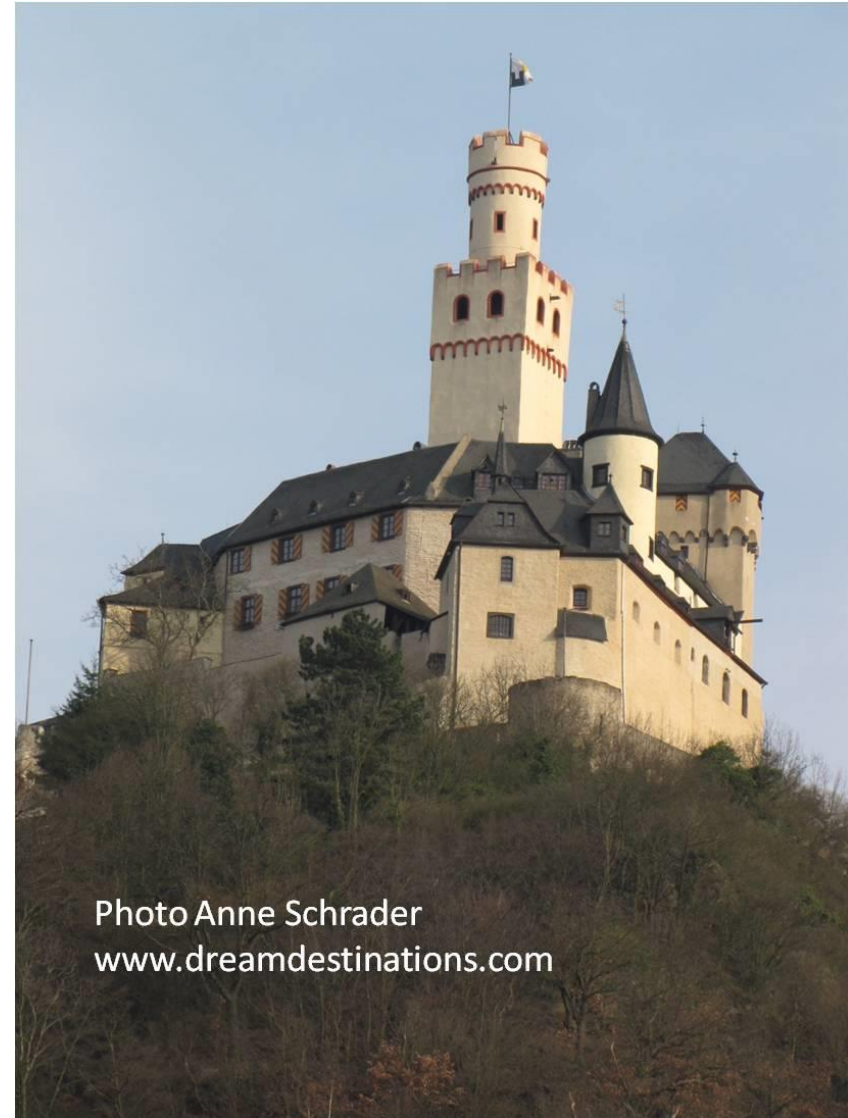
Marksburg Castle, Germany