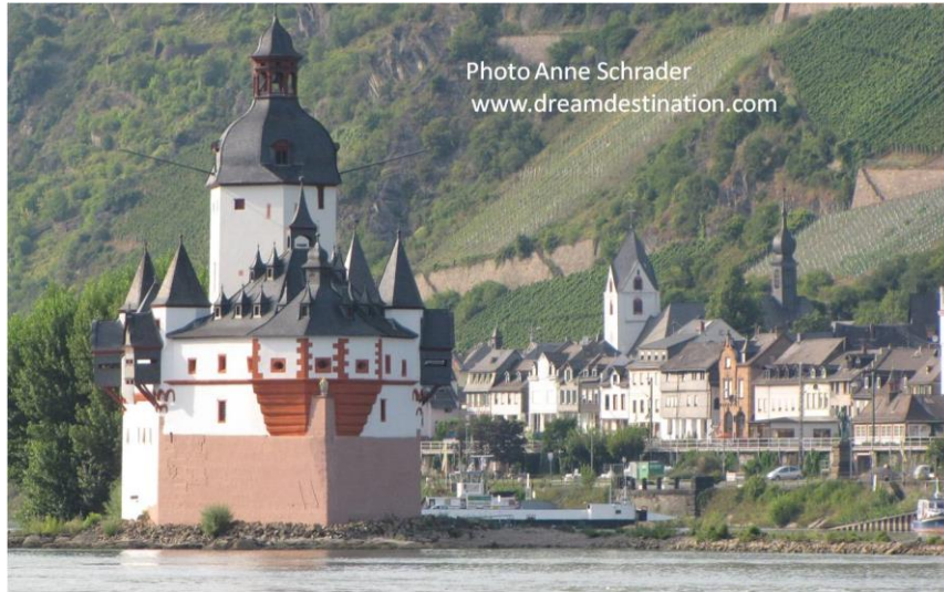
Pfalzgrafenstein Toll Station, Germany