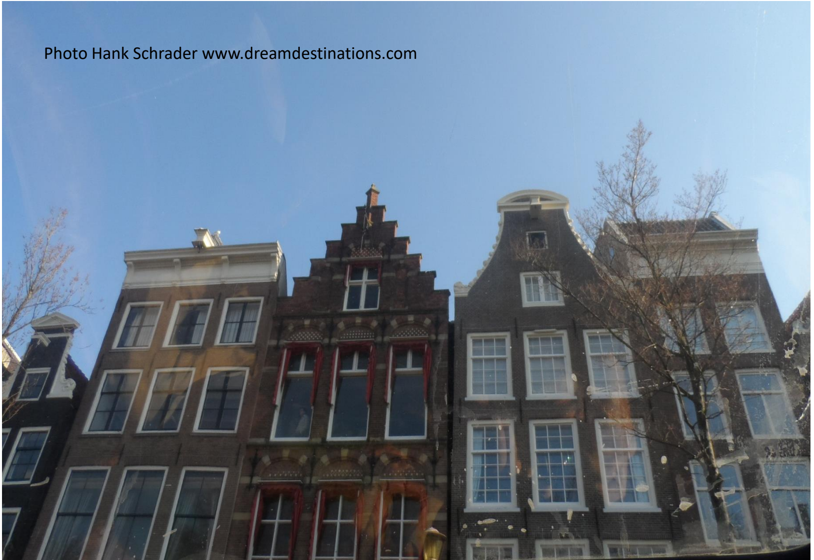
www.dreamdestinations.com