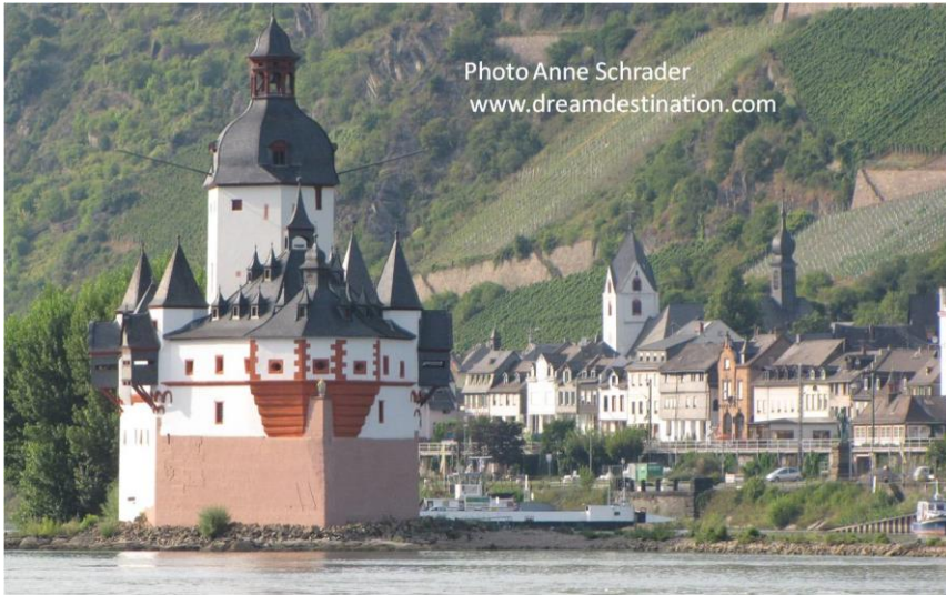
Pfaffenstein Toll Station, Germany