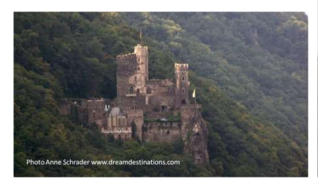
Rheinstein Castle, Rhine River Castles