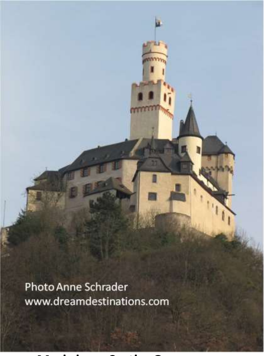
Marksburg Castle, Germany